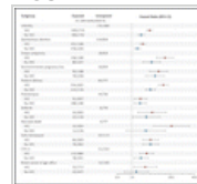
Hazard Ratios for Adverse Health Outcomes in the DESAD and Dieckmann Cohorts, According to Diethylstilbestrol (DES) Exposure Status and, in the DES-Exposure Group, the Presence or Absence of Vaginal Epithelial Changes (VEC) at Entry Examination.